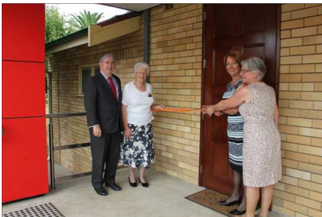
Cutting of the Ribbon

Necessary refurbishments had been carried out over several months to the Chambers building including an access ramp and verandah, new entry, accessible toilet and ceiling fans.