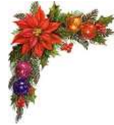
Members 2015 Christmas Party