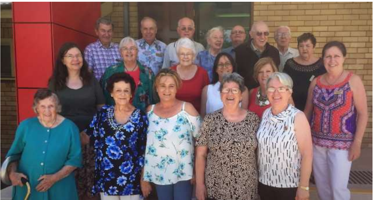
The Society's members 2016 Christmas Luncheon