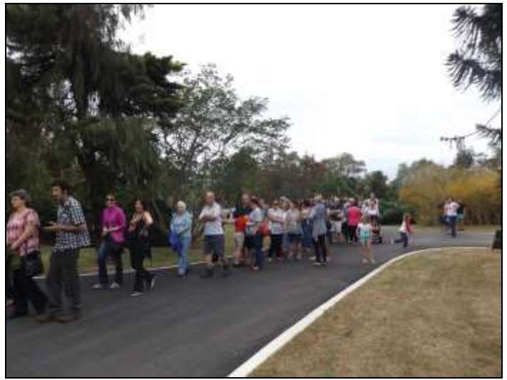
This photograph shows just a small portion of visitors patiently waiting in line for the tour.