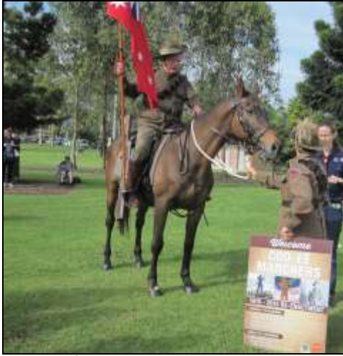
5 th Light Horse Assn.